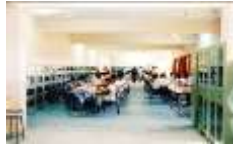
Auditorium / Seminar Halls / Amphi