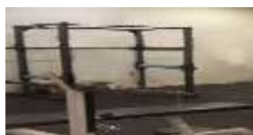
Facilities for disabled